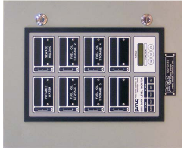
Tank Gauging System